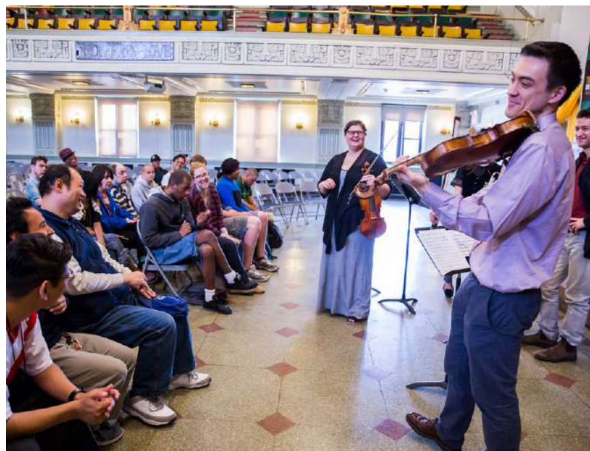
Interactive community performance at AHRC