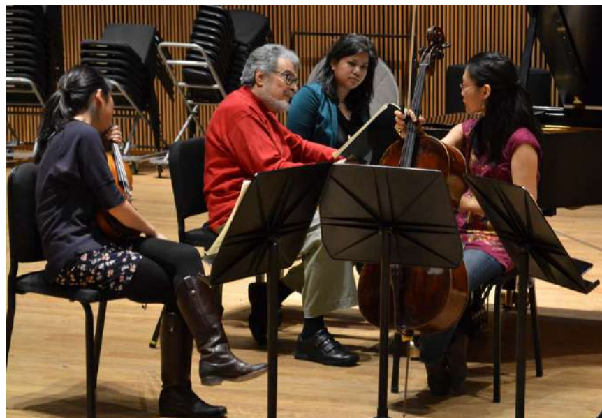
Master class with pianist Leon Fleisher