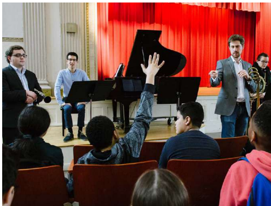
Ensemble Connect fellows presenting an interactive performance at MS224 Manhattan East

Each year Ensemble Connect presents 80 interactive performances in schools and 20 in community venues across New York City. Interactive performances are designed to invite audiences into the exploration and discovery of a piece of music or a musical concept and include listening activities aimed at deepening and enriching the concert experience. Fellows perform these assembly-style for large, schoolwide audiences and also adapt them for community venues such as prisons, senior care facilities, homeless shelters, and organizations working with special needs populations.