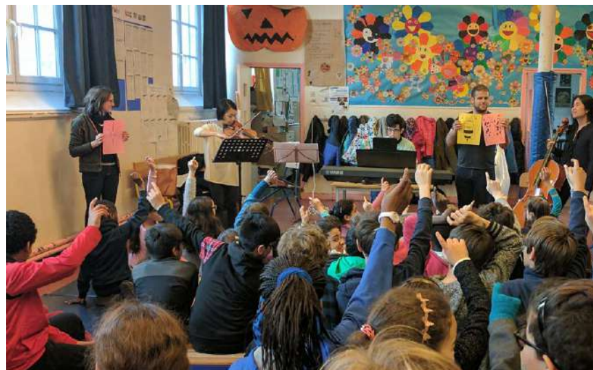
Interactive performance at Dorothy Nolan Elementary School in Saratoga Springs