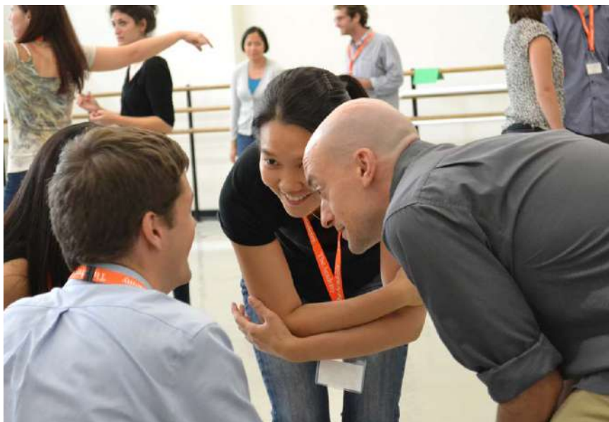
Professional development workshop

Fellows also receive coaching sessions with musicians of their choice such as Pamela Frank, Leon Fleisher, and Charles Neidich, along with access to world-renowned composers such as John Adams, David Lang, and Steve Reich.