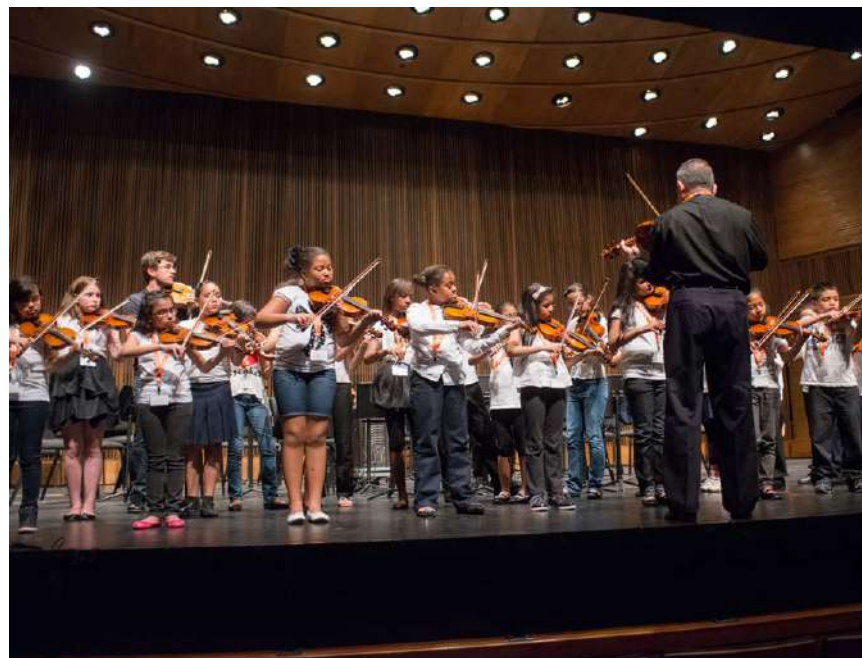
Partner School Performance Festival at The Juilliard School