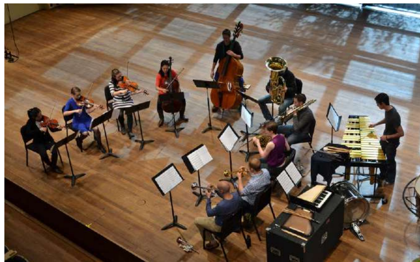
Ensemble Connect rehearsal at Skidmore College

Twice annually, the fellows participate in a five-day residency at Skidmore College in Saratoga Springs, New York. While on campus, the fellows offer master classes, lessons, and class demonstrations, as well as play side by side with students of the Skidmore College Orchestra and read student compositions. Ensemble Connect performs in the Arthur Zankel Music Center's Helen Filene Ladd Concert Hall, presenting concert programs that include world premieres commissioned by Carnegie Hall. The commissioned composers collaborate with the fellows during the residency before the world-premiere performances. In addition, the fellows and composers offer interactive demonstrations and informal performances beyond the music department in classes, dormitories, and libraries, as well as in schools and other community venues in Saratoga Springs.