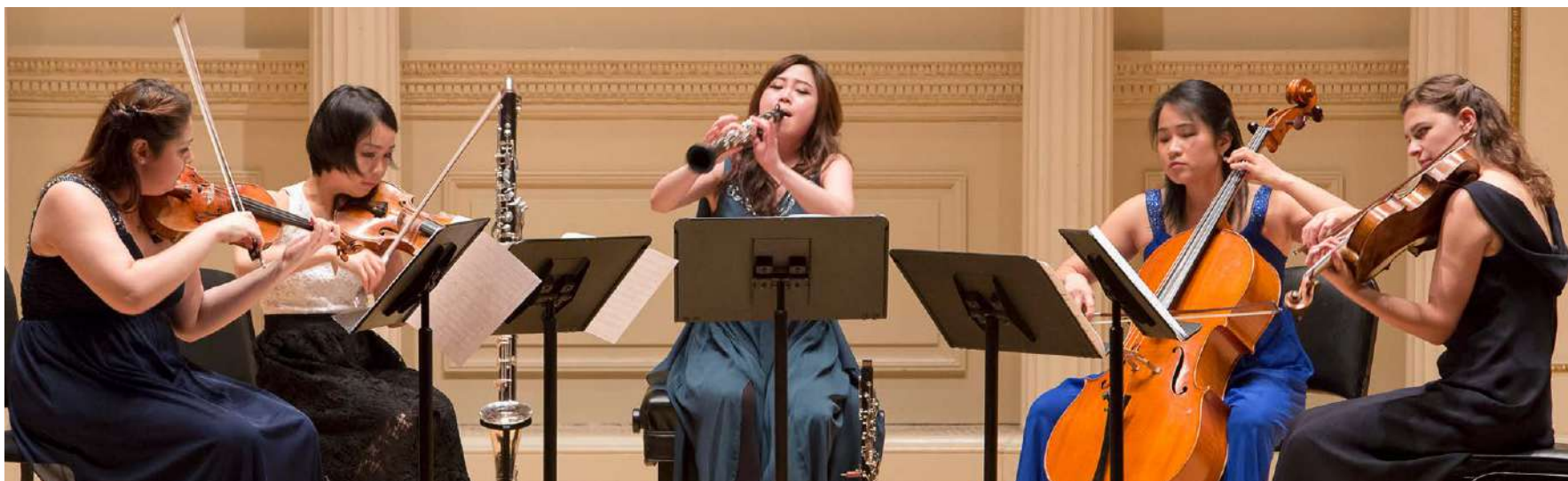
Performance at Weill Recital Hall